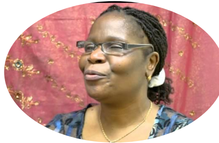
Evernice - Associate Minister