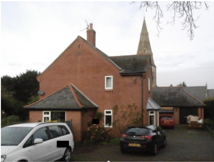
Side view from drive

The property is situated adjoining and with access to the parish churchyard. The house is constructed with external cavity walls off a blue brick damp proof course with facing bricks to all elevations. The pitched roofs have a slate covering. All windows are double-glazed U-pvc. To the ground floor, the accommodation comprises entrance porch, hall, study, living room, dining room, kitchen, utility room, cloakroom & WC. To the first floor are four bedrooms, bathroom and shower room. The house has a detached single garage and inter-connecting car standing covered way, incorporating fuel and garden stores. The property has a tarmacadam driveway and brick paved car standing to the front of the house. The house has extensive gardens on all sides.