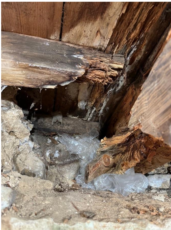
Figure 3 - Wet rot within the South Aisle beam.

The PCC should be commended for their efforts and the Church Buildings Team wish to thank them for everything they do to care for their church building.