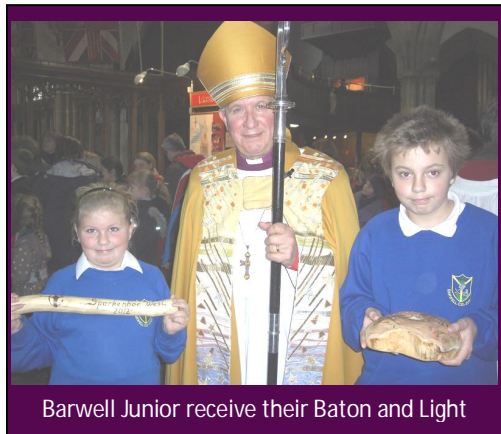
Barwell Junior receive their Baton and Light

Dear All, Welcome back and I do hope you all had an enjoyable Christmas and New Year!