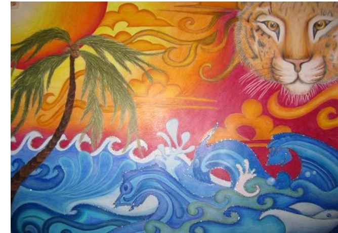
'Sanctuary' by Gemma Pollock, Furness Academy

(Administrative Office Telephone Number: 0116 261 5352)