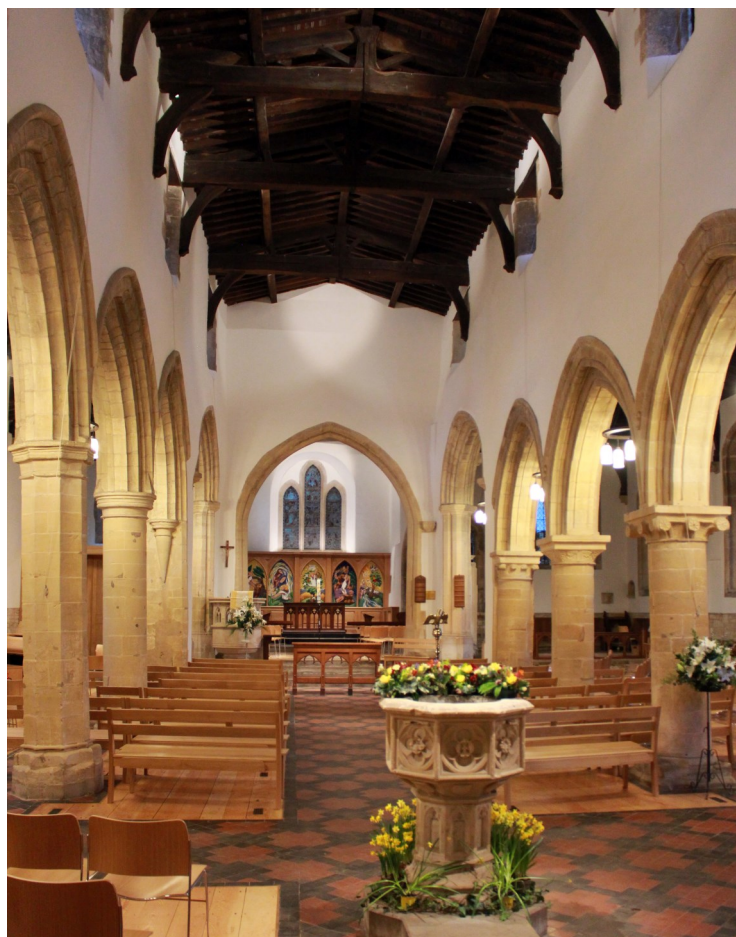
Enstone, St Kenelm

Further guidance is available from Historic England's lighting webpages on internal lighting in historic buildings , and the Chartered Institution of Building Services Engineers (CIBSE) Lighting Guide 13: Lighting for Places of Worship (2018).