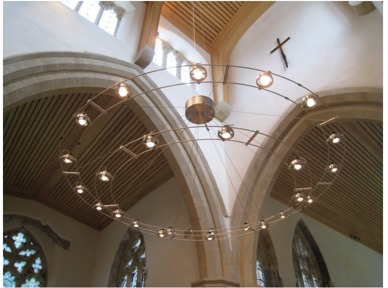
St Brandon, Brancepeth

Cheaper LEDs may prove to be a false economy as they may have a shorter lamp life. It is important to specify established manufacturers, and to remain consistent with lamp/luminaire selections (particularly in lighting projects that are phased to match funding).